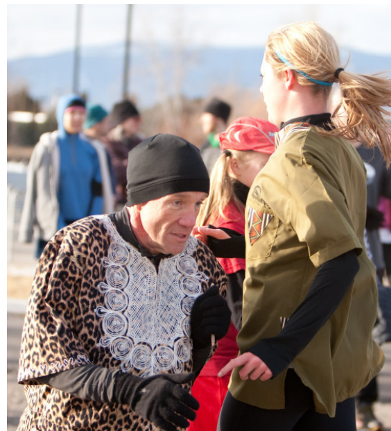
Another Scrumpy Jack handoff.