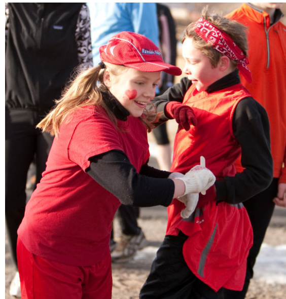
A great Scrumpy Jack handoff to the second runner.