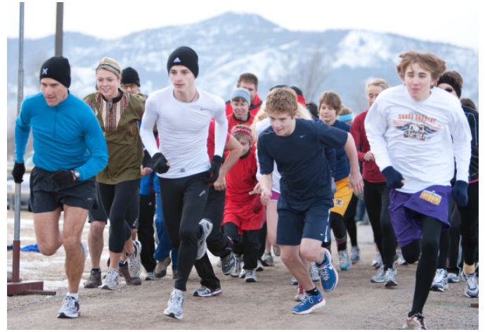
Scrumpy Jack – Start.