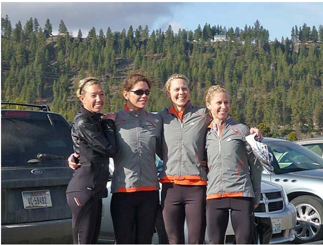
The Mountain West Track Club Team at National Cross Country Championships.